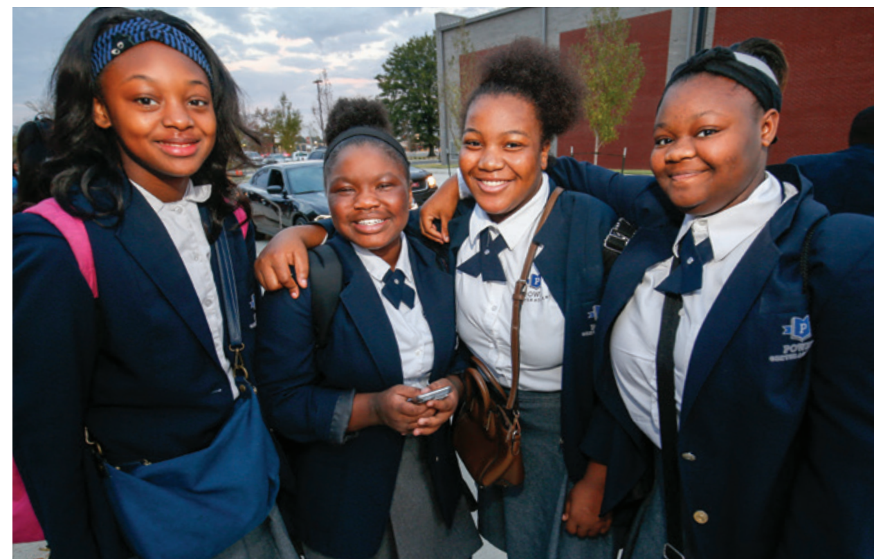
The once grand Hickory Hill neighborhood finds new life when caring partners step in with vision, teamwork and resources.